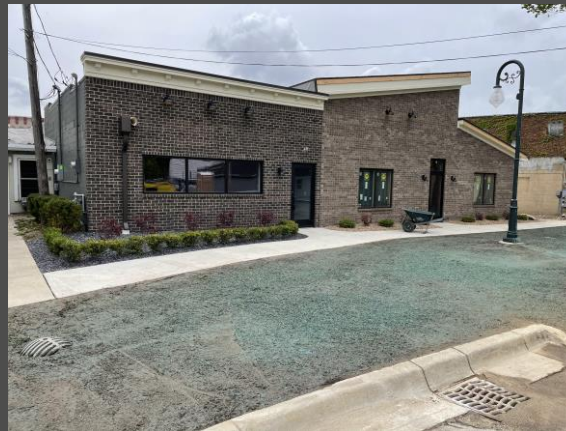
AFTER REAR OF BUILDING