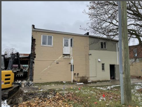
BEFORE REAR OF BUILDING